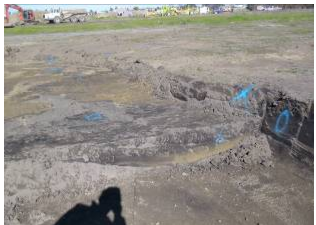
Here As contamination removed to a depth of 0.7 m

Using the XRF it was made certain the maximum remaining concentration on the site was lower than 95 mg/kg. At this point 'scraper tracks' were painted on the surface: solid blue tracks where contaminant levels were 40 - 95 mg/kg As, intermittent blue lines where As levels were 20 - 40 mg/kg ('neutral') and white lines indicated tracks over areas with As levels below 20 mg/kg. One 50 ton motor scrapers would pick-up soil over a blue track and lay this out in a 50 mm layer on the mixing pile and the second motor scraper would pick-up a white marked track and overlay the blue marked soil with a 50 mm layer of white marked soil.