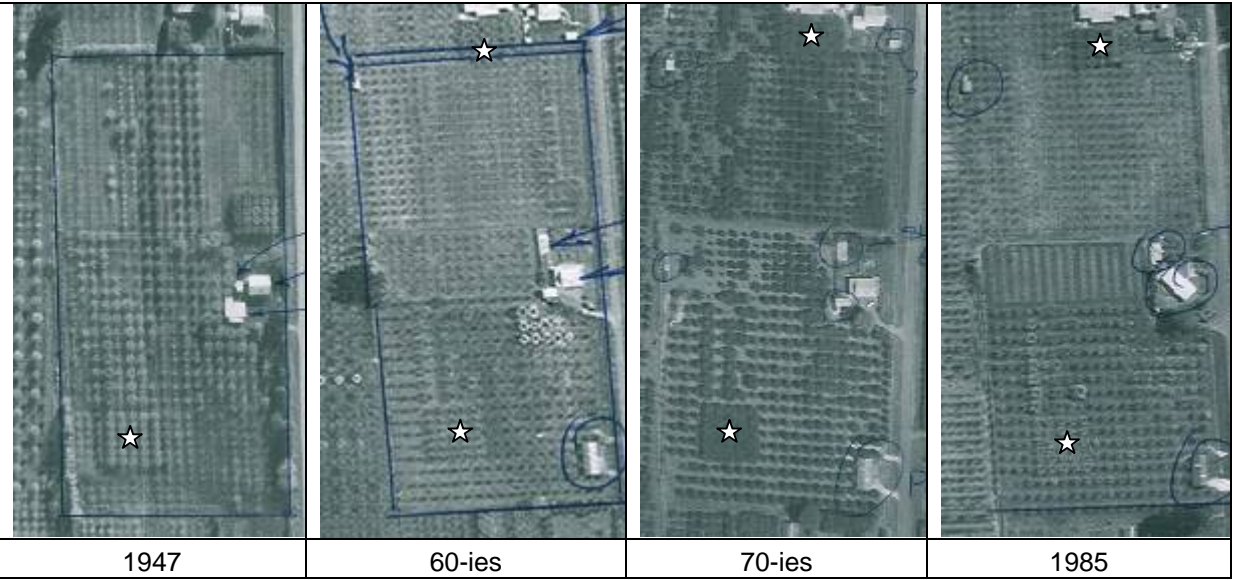
Figure 1: Aerial photographs. The star indicates the suspected pear trees

When the project was awarded the TRIAD approach was followed starting with an assessment of the aerial photographs.