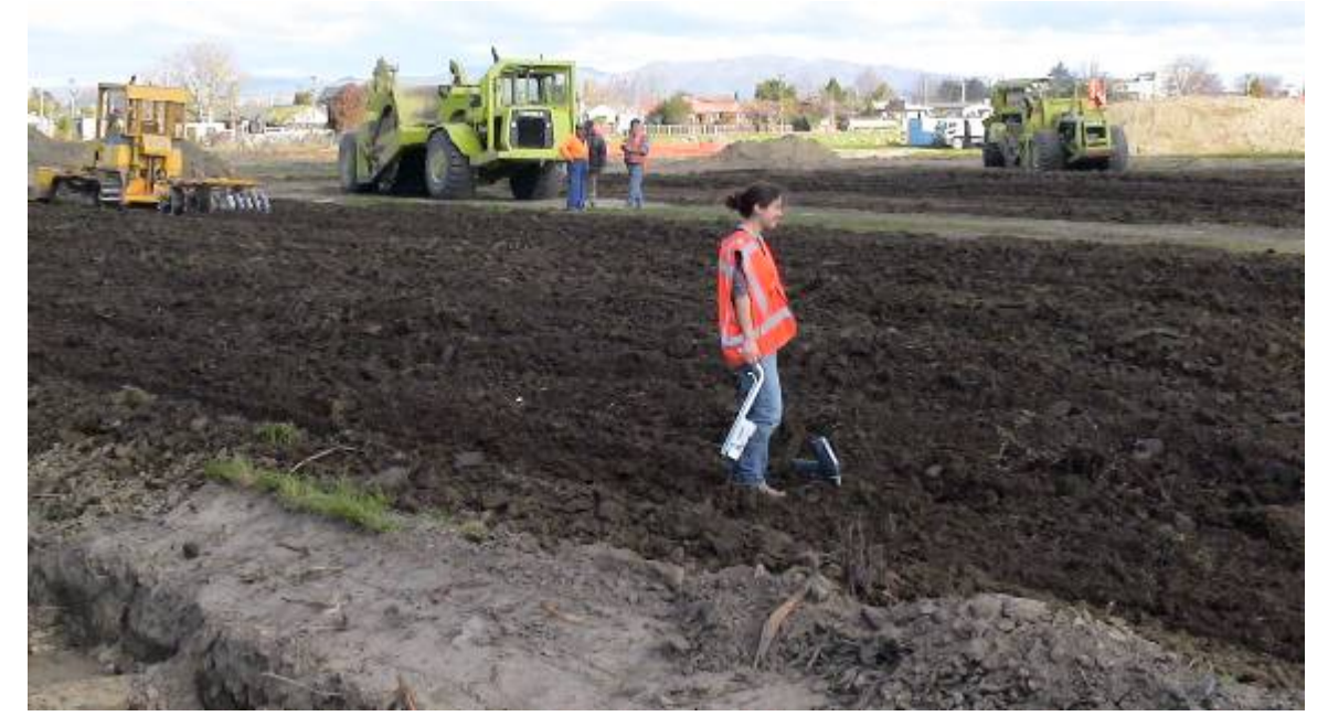
Validation with XRF of disked layer in progress. Temporary mix-pad in the background.

After a full layer is laid out over the mixing pile of 120 \times 18 m these layers were mixed thoroughly using two disking units. When mixing was deemed complete the surface of the mixing pile was tested with the XRF at 30 - 50 locations per layer. Paint spots indicate 'acceptable' a circle means 'more mixing and a cross means 'remove from mix pile'. Removal was done with the motor scrapers and that soil was laid out next to the mix pile, inter-bedded with 'clean' material and then re-placed on the mix pile. Well over 100 layers were brought onto the mix pile, raising it to 6 - 7 meters height.