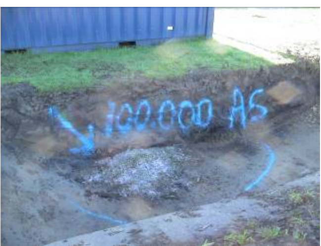
A quick XRF check revealed extreme copper, chromium & arsenic concentrations in some ashes.

Fortunately the ashes were discovered before the main site earthworks took place, and were removed by the neighbour effectively.