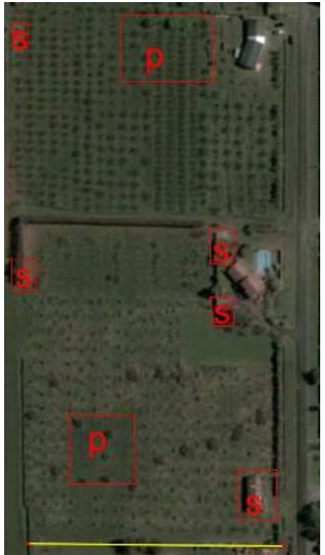
Figure 2 2005 aerial photo with identified potential hotspots, scale bar = 150 m.

The first step conceptual site model CSM-1 shows object related potential hotspot areas: