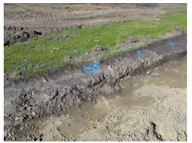
A lobe with 155 mg/kg As still to be taken out